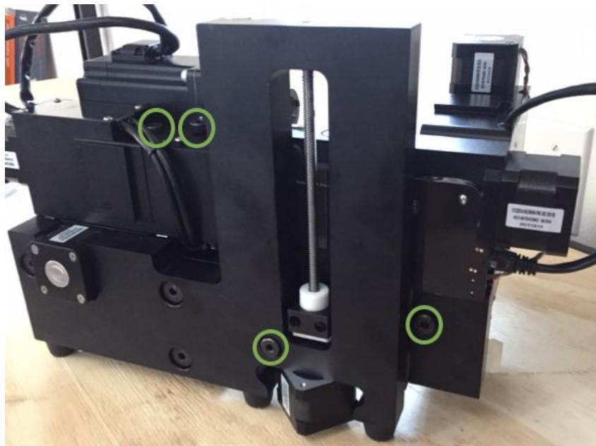
Figure 1: Pocket NC V2 Series all shipping bolt locations shown in green circles.

The shipping bolts are M6 shoulder bolts of three different lengths. The 4 mm hex key needed to remove the bolts is included in the toolkit shipped with the machine. The bolts are installed only hand-tight.