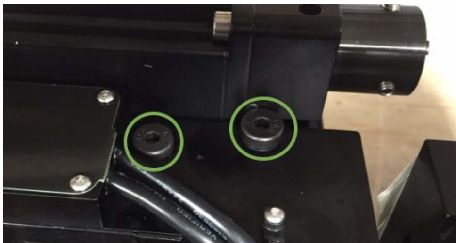
Figure 3: Close up of shipping bolts in green on X-carriage

The other two shipping bolts are located on the X-carriage, behind the spindle. They are both accessed from the top of the machine. The right bolt locks the spindle mount to the X-carriage. The left bolt locks the X-carriage to the main block.